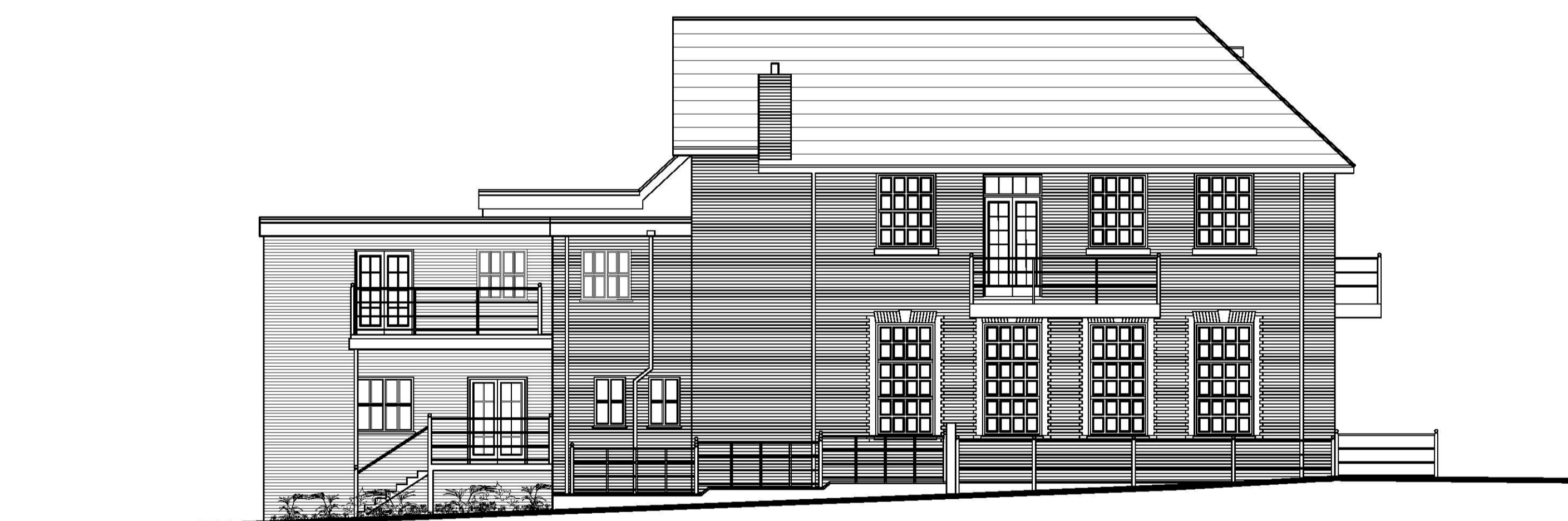
PROPOSED WEST ELEV SCALE 1:100