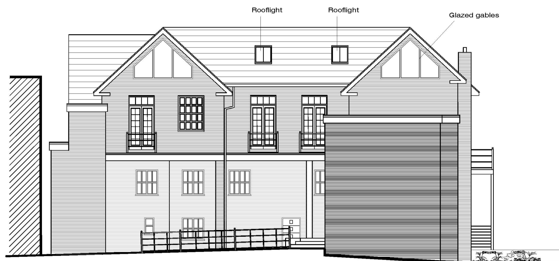
PROPOSED REAR ELEV SCALE 1:100