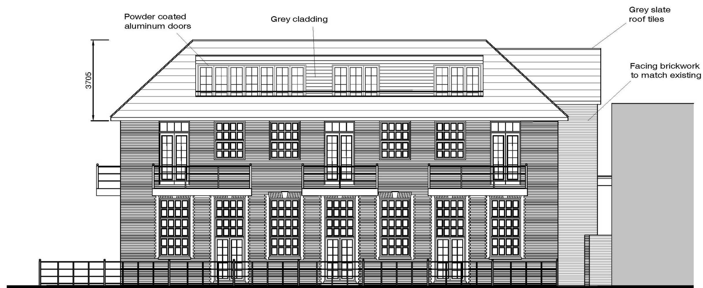
PROPOSED FRONT ELEV SCALE 1:100